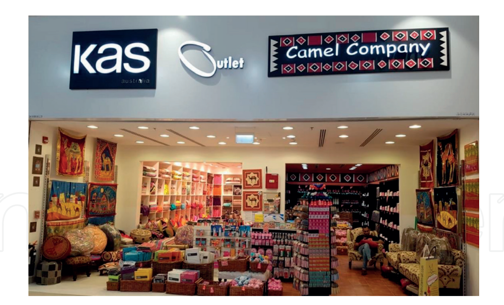
Figure 3. Camel milk based products in Australia.

Australia (Australia). Large camel farms are being established, and increased funding for camel research is noticed. Moreover, a wide variety of camel milk-derived products are now available in the market, including various new dairy products, such as pasteurized milk, fermented milk, flavored milk, butter, cheese, and milk tea [37, 38]. As a specific example, Bactrian camel milk is used for making cheese, butter, and yogurt in Mongolia [13]. Traditional fermented camel milk is produced and consumed in several countries, such as, Shubat (Turkey, Kazakhstan, and Turkmenistan), Suusac (Eastern Africa, Kenya, and Somalia), and Garis (Sudan and Somalia). Despite the effort made by researchers to produce yogurt from camel milk, the manufacturing of this by-product needs more study due to the fact that camel milk does not easily coagulate [39]. In Dubai, a coffee shop business specializing in different hot and cold drinks and pastries made with fresh camel milk called "Cafe2go" was set up recently. Since 2011, it has expanded successfully to 10 locations in Dubai and Pakistan and is soon to be opened in Oman and Saudi Arabia. Furthermore, camel milk utilization is not limited anymore to the producer region only, but it is now marketed overseas also. It has recently been exported from the United Arab Emirates to the European Union [40]. Furthermore, recent studies have investigated the optimization of fermentation processes [41] and cheeseproduction from camel milk [42].