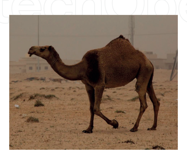
Figure 1. Dromedary camel.

by the Bedouins (people who inhabited the desert) where access to green vegetables and fruits is limited, thus providing, in that case, a significant nutritional relevance. Although camel milk is linked to the culture identity of Bedouins for a long time, small-scale and large-scale farms for intensive production of camel milk have been implemented worldwide only in recent years. The establishment of these farming systems was synchronized with the increased consumer's interest in unprocessed raw non-bovine milk consumption. While cow milk represents 82% of the total quantity of milk produced in the world, non-bovine dairy species provided 133 million tons in 2016 [1]. Camel is considered one of the most important dairy animals contributing to about 0.3% of the milk produced in the world [1] ( Figure 2 ). Raw camel milk has